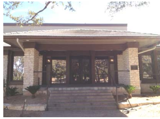
Entrance to the Hills Country Club:

Wheelchair access is at the far right front doors of the building.